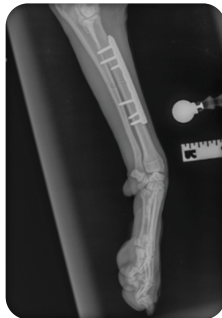
Fracture repair of a broken radius and ulna, done by our Te Kauwhata team.

This expansion is more than just new equipment and services; it's a testament to our commitment to the local farming community. We are passionate about supporting you and your hard-working dogs, and we look forward to welcoming you to our new Working Dog Centre.